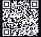
TSW202 360° VIEW